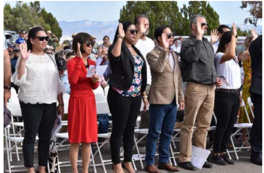
New citizens are sworn in at the naturalization ceremony at the Colorado National Monument in September 2019.

In addition to citizenship support, HAP also continues to provide immigration legal assistance. This program plays a critical role in rural communities where there remains a lack of legal services, and where available services are often out of reach for low-income residents. The lack of parity between demand for affordable immigration legal assistance and availability of these services is such that HAP often serves clients not just from Colorado, but from other neighboring western states as well.