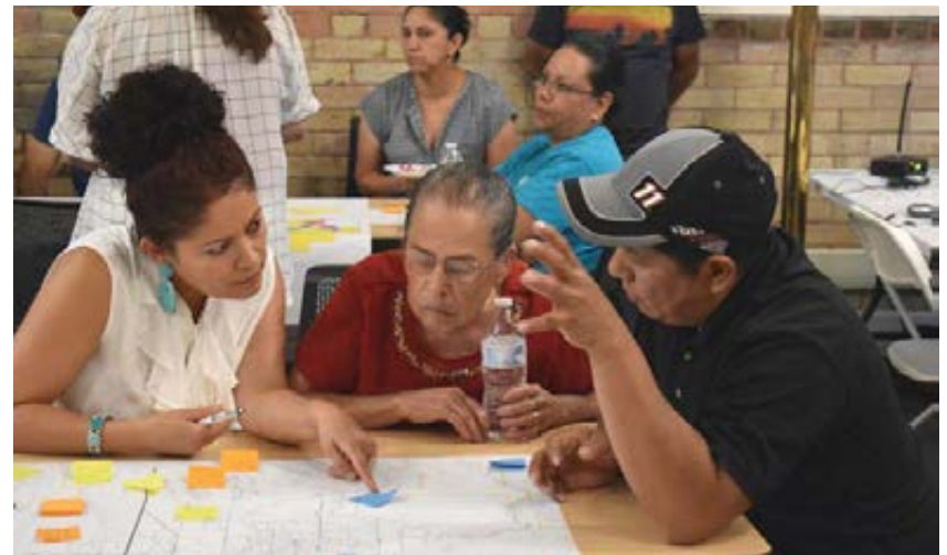
Participants discuss issues affecting their community.

One of the traditional barriers to this kind of participation is the lack of inclusion of Spanish-only speakers. Promoting language justice, several workshops were conducted in Spanish, enabling more people to make their voices heard and advocate for positive change.