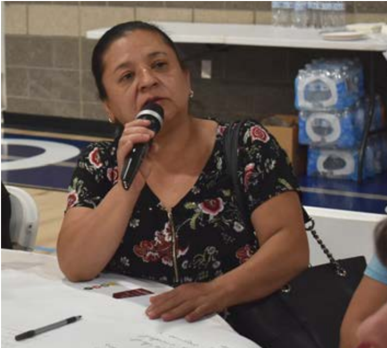
A community leader speaks at a Spanish-language meeting in one of the comprehensive planning workshops.

"HAP's participation in these city planning processes has been another part of our effort to promote inclusivity and equity at the community-wide level."