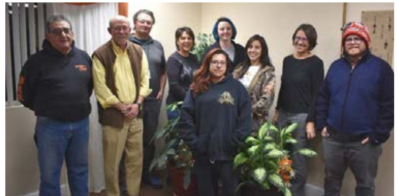
Project participants and coordinators pose for a photo during a meeting at Anciano Tower in Montrose.