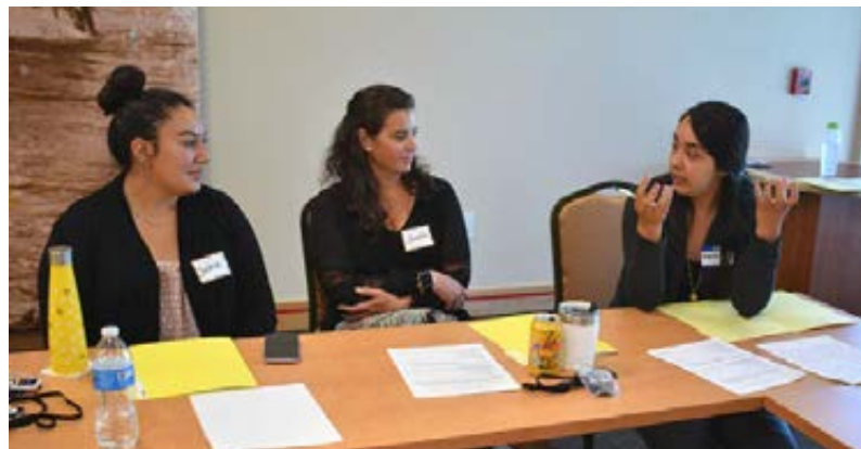
Community partners in the Health Equity Learning Series discuss issues affecting their communities.