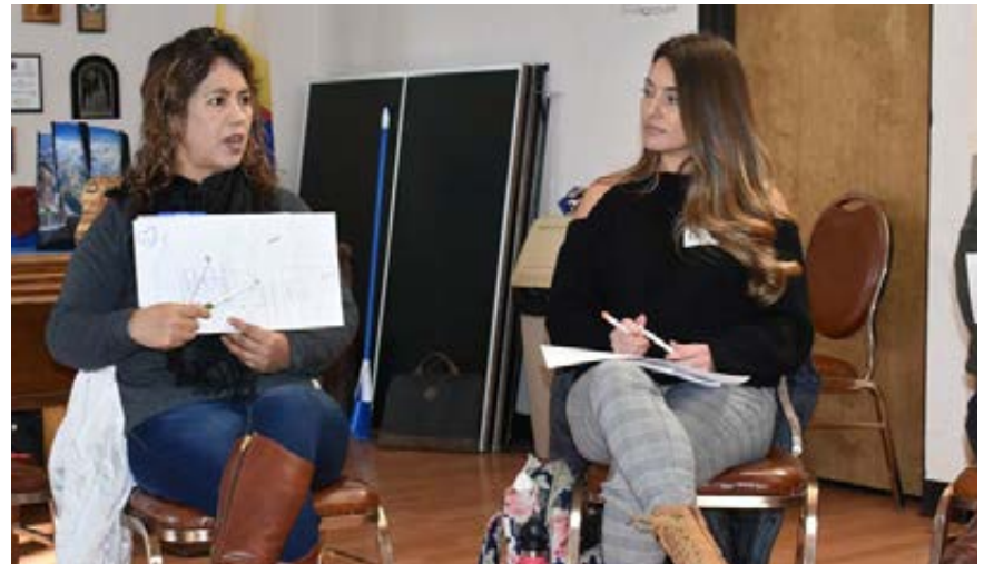
HAP members at a leadership retreat.