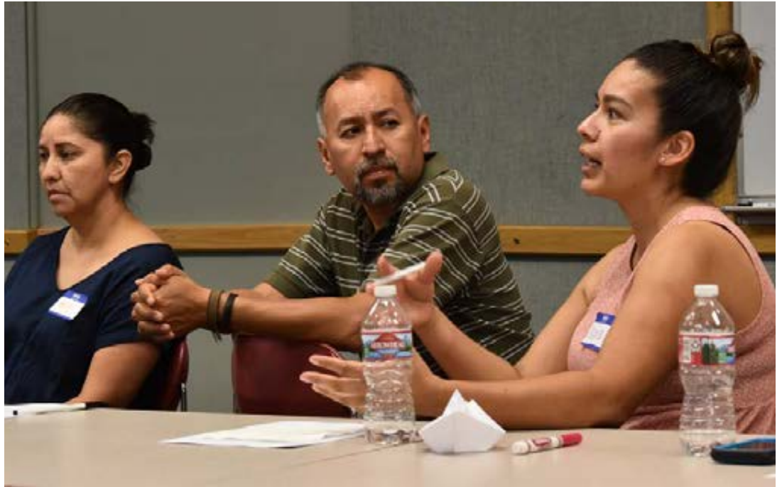
HAP's Executive Director listens to a community member speak at a meeting.