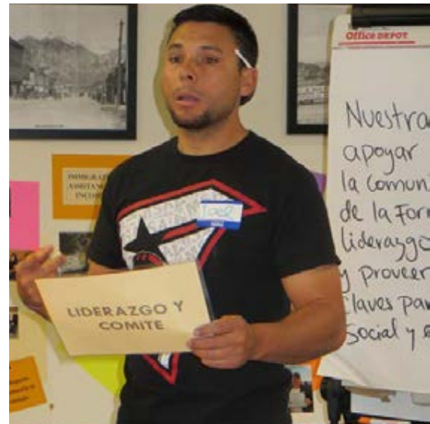
HAP board member facilitates a community work plan.

In 2019, HAP worked to establish a group of mobile home park residents to form the Hispanic Housing Committee in Montrose. This committee will advocate for improved conditions, as well as fair regulation of mobile home parks on the local level. This work is made even more important by the fact that mobile housing is one of the few affordable housing solutions remaining in a state where the median home price continues to rise.