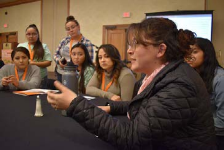
Local leaders participate in the 2019 Colorado Immigrant Rights Coalition's member assembly.

Throughout 2019, HAP facilitated leadership retreats aimed at empowering community members to recognize their potential for leadership in their communities.