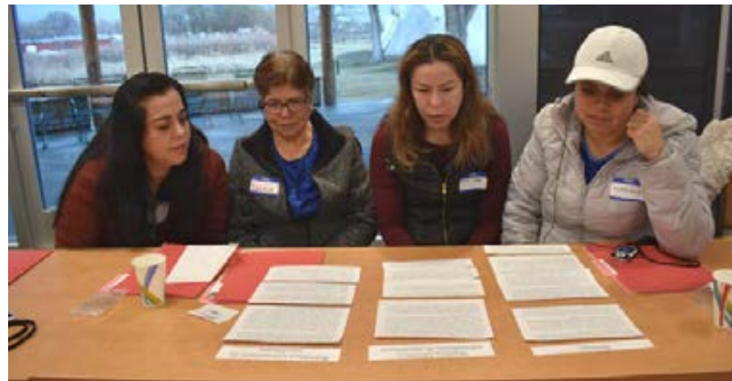
HAP members learn about civic engagement and how to make change in their community.

HAP also promoted conversations around equity as a partner in the Health Equity Learning Series, which focused on dialogues about disparities in health outcomes in our communities. In the Transcultural Bridge training, discussions focused on building skills for living and working with people from other cultures in order to dismantle structural biases that stand in the way of equitable outcomes. These activities contributed to the Montrose Health Equity Advocacy Team efforts focused on building capacity for advancing health equity.