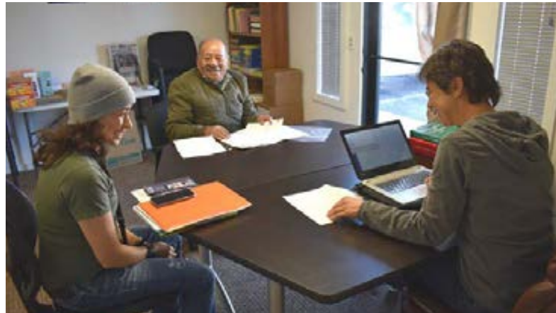
Citizenship applicants receive legal consultation.