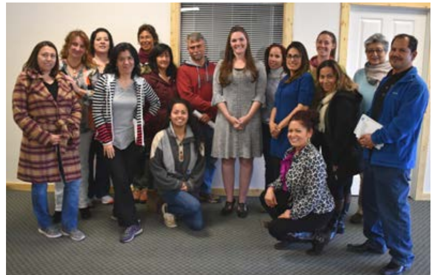
Training for future interpreters.

To help satisfy the increasing demand for interpretation, HAP sponsored interpretation trainings in Gunnison and Grand Junction aimed at teaching future interpreters about career prospects in this growing field. HAP will continue to promote language justice within institutions in West Slope communities.