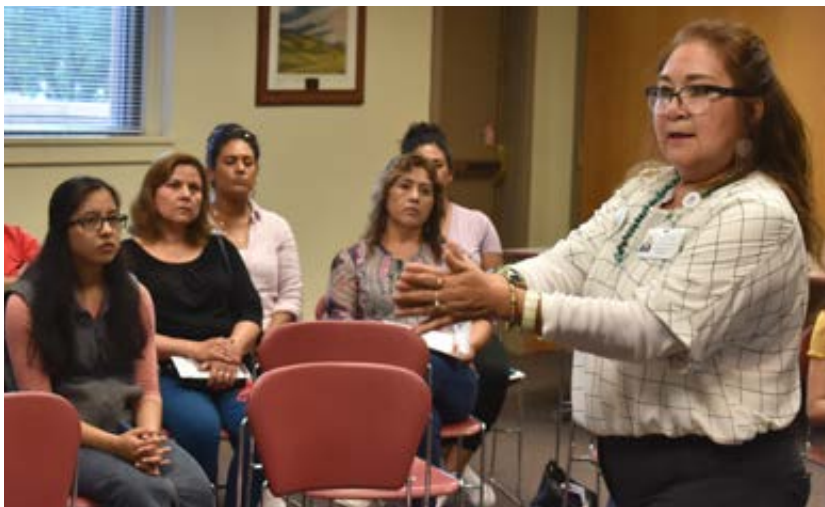
A mental health worker leads a community conversation with HAP.

Mental health awareness and access to mental health care is an issue that affects every community in Colorado. With the goal of spreading awareness and reducing stigmas that still surround these issues, HAP facilitated several discussions in Spanish.