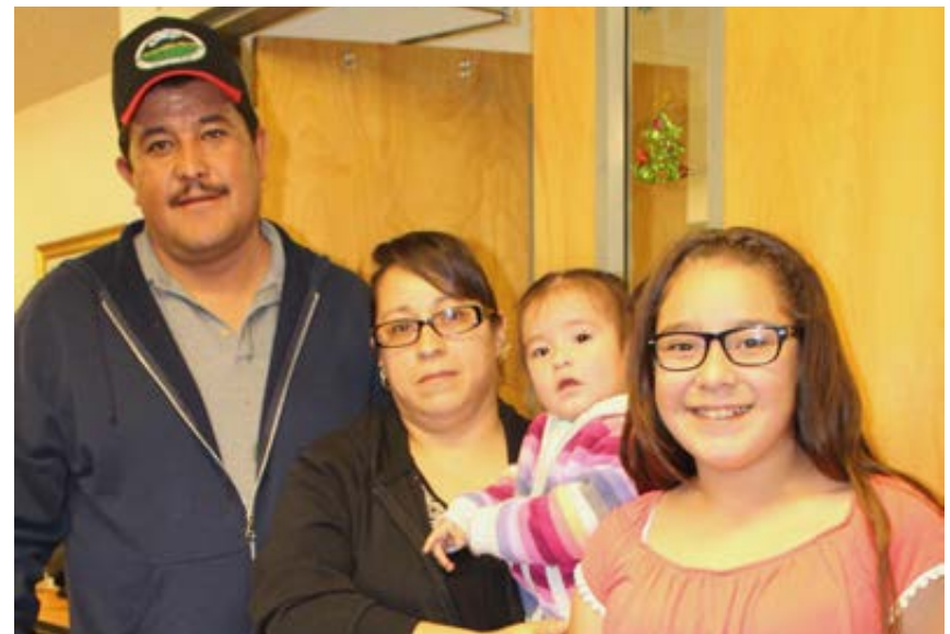
Thanks to the changes to the law, many West Slope families were able to apply for a driver's license for the first time.

These improvements resulted in the creation of seven new offices that issue SB-251 licenses including Montrose, Durango and Glenwood Springs. HAP is working with the DMV to serve as an official support agency for residents who are interested in obtaining their first SB-251 license, or renewing their existing license.