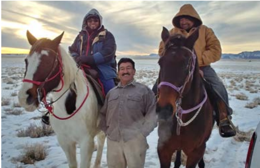
Shepherders remain excluded from critical workplace protections.

In 2019, HAP collaborated with state partners in support of changes in the coverage for the Minimum Wage Order that the Colorado Department of Labor and Employment (CDLE) had opened for comments.