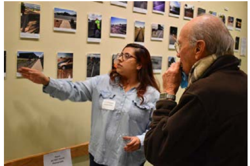
A resident talks to a community member at the opening of the Photovoice exhibition at the Montrose Library.