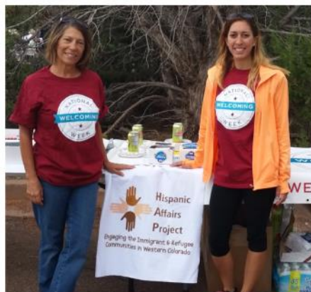
Photo: Volunteers help register new voters. HAP and OFA-Grand Junction work together in the campaign to ensure that our communities will be ready to vote in the next elections.