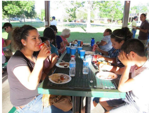
Welcoming Community Picnic -Grand Junction June 2012

We encourage native-born community members and immigrants to exchange stories, break bread together, and build connections and relationships.